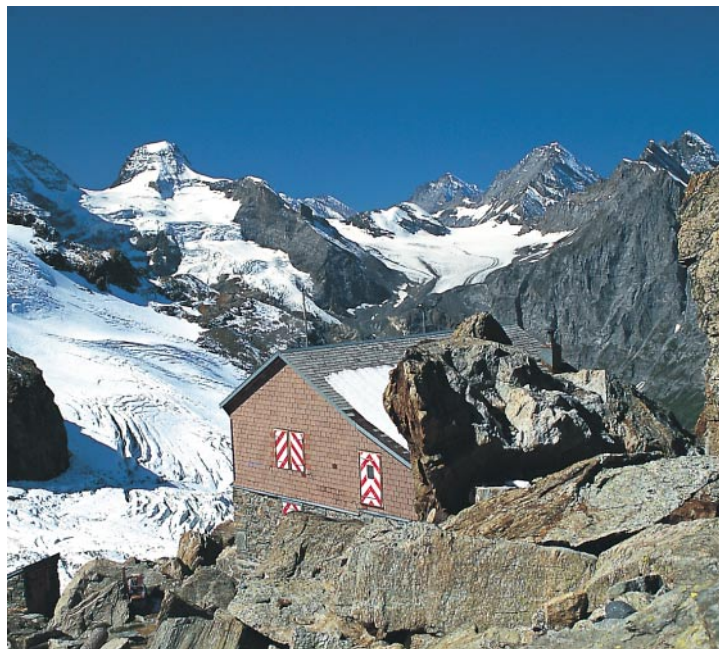
What a location! View of Tschingelhorn, Doldenhorn and Blüemlisalp (from the left).

Important advice: don't make a stop between Altläger and Bäreflue where ice could avalanche down from the Jungfrau, nor at the rock where it says '½ way to the Rottalhütte'. Stop instead at the ruins of an alpine building (Point 1937m).